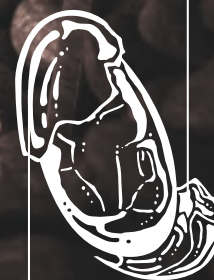
Fig. 3.2 The Nib

Flavours of: toast, umami. We use for: tea infusion drinks, cooking stock & spice mixes.