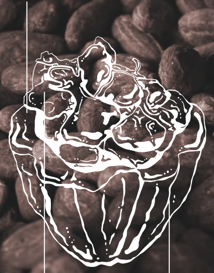
Fig. 2.2 The Bean Needs to be fermented and sun dried, then delicious. See fig.3